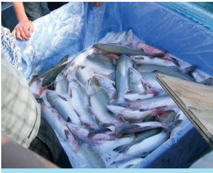
TFN processed three totes of fish for community programs during the summer FSC fisheries.

Three totes of fish were brought to the cannery to be processed for community programs, and up to three spring salmon per adult Member, plus one per child, were allocated for the food fish distribution. Executive Council directed staff to ensure support was available for Elders who required assistance processing their fish.