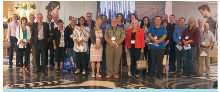
Representatives from TFN and Metro Vancouver toured the mall and learned about Tsawwassen artists as part of the Community to Community Forum.