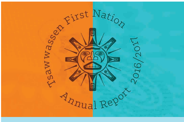
TFN's 2016–2017 Annual Report.