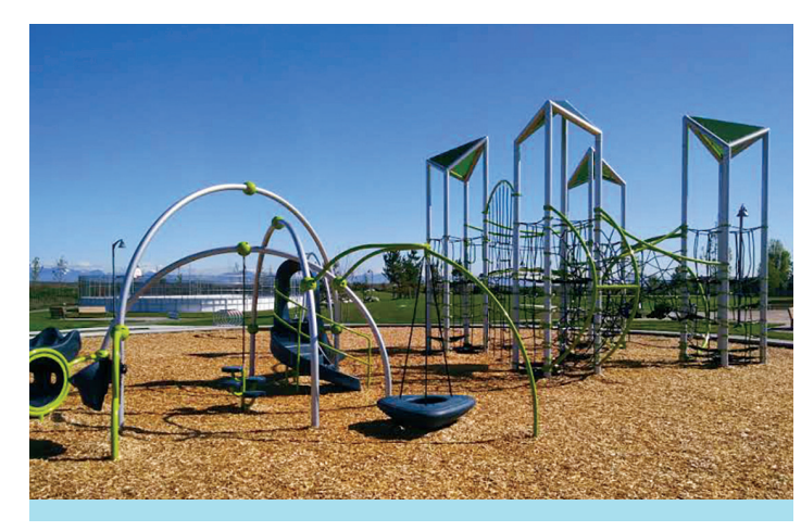
Endless hours of fun and games await at the new sports field!

Phase 2 of the TFN sports field is now complete and open for use. Features of this new phase include the children's playground, fitness circuit, and a sport box for lacrosse, hockey, and basketball.