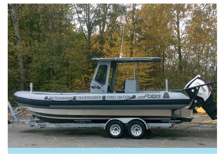
Sû¿ecx;n;m will help the Natural Resources Department keep a lookout over Tsawwassen Fisheries.

Executive Council approved registering the new TFN patrol boat as S\hat{u}_{i}ecx;n;m , which means "to keep a lookout' in həndəminəm. S\hat{u}_{i}ecx;n;m will serve as a patrol vessel for Tsawwassen Fisheries.