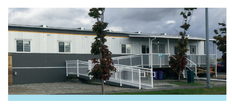
The Lands Department's temporary office space on Falcon Way.

To accommodate the Lands Department's continuing growth, Executive Council approved the purchase of a prefabricated office space. The department moved to its temporary new home at 2460 Falcon Way in March 2017.