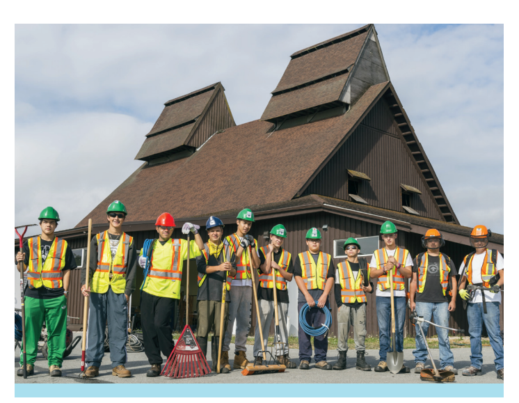
Participants and staff of the TFN Joint Venture Owners' First Nation Youth Work Experience Program in front of the Longhouse.

Executive Council directed staff to improve the safety, efficiency, and durability of the Longhouse by conducting renovations to restore the roof, remove the cupolas, and install custom-built wood stoves and steel chimneys to ensure the main floor stays warm during winter months. These renovations were completed in fall 2016.