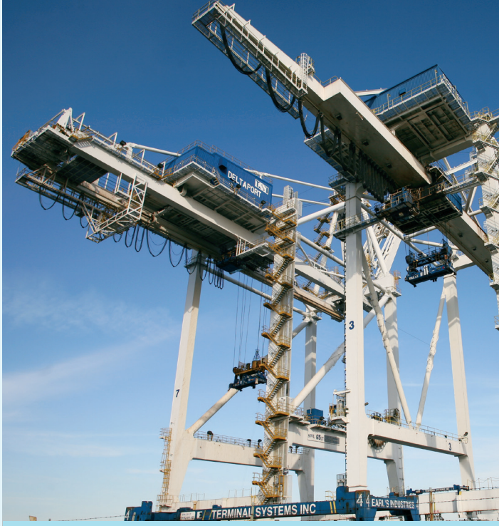
Ship-to-shore container cranes at Roberts Bank.