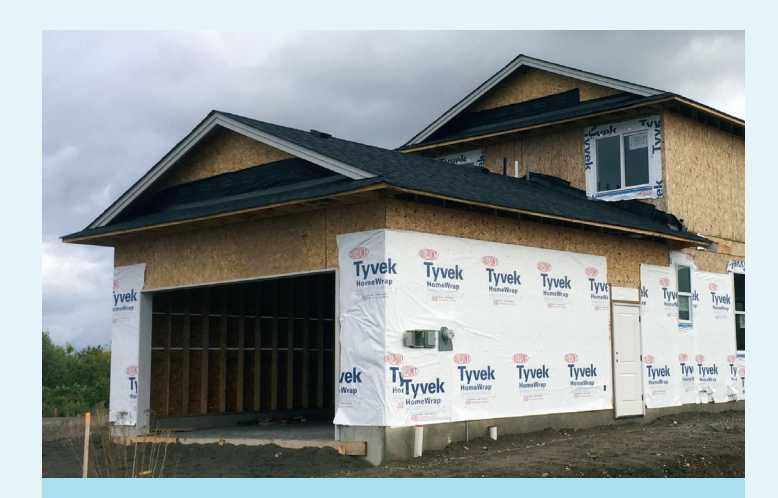
A Member's home under construction on Falcon Way.