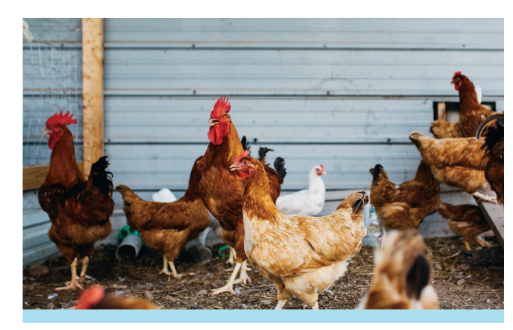
Options for poultry regulations are being developed for consideration by Executive Council.

Executive Council directed staff to prepare options for regulating poultry on Tsawwassen Lands. In response, staff are developing a comprehensive set of options for review by Executive Council, which may include standards around the number of poultry that may be kept, the dimensions and location of enclosures, registration requirements and enforcement methods. Any policy or regulatory decision on this issue would be subject to further consultation with Members.