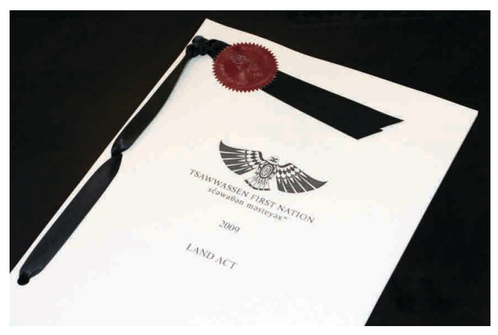
A Land Act review timeline and consultation plan was approved by Executive Council in January .

The TFN Constitution Act requires that the Land Act be reviewed within 10 years of Treaty. In January, Executive Council reviewed and approved a proposed Land Act review timeline and consultation plan. Executive Council further directed staff to concurrently review the Land Use Planning and Development Act .