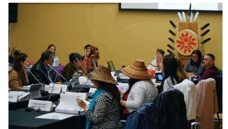
Legislators in session.