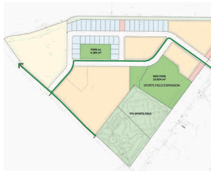
Conceptual Plan of Aquilini Phase 2 showing the sports field expansion

Executive Council approved the proposed neighbourhood plan amendment and the related zoning amendment after consultation with Members. These amendments will enable the sports field expansion with moderate density increase. With Executive Council direction to ensure coordinated development of open spaces, Lands staff have been taking a more strategic approach to the parks development program. Aquilini has committed to extending the existing sports field and help with construction of the fieldhouse (concept plan provided in Figure 1). Staff have confirmed that the fieldhouse will have a similar exterior design to the Youth Centre for visual cohesiveness as both buildings will be in close proximity.