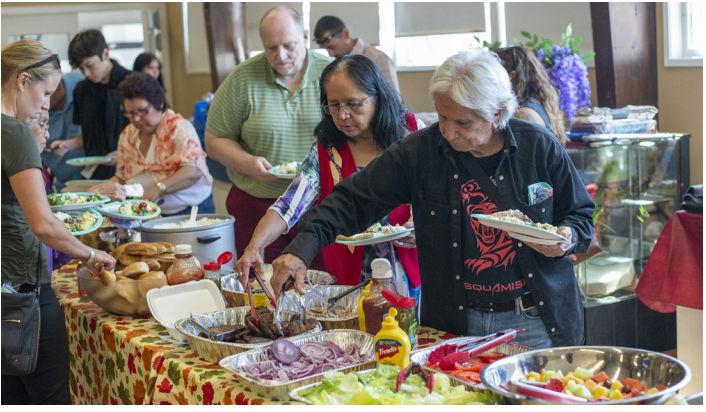
TFN hosted an All Nations Elders Lunch on July 16, with the help of the Delta Police and TFN Youth. There were 120 Elders from Katzie, Upper/Lower Squamish, Musqueam, Vancouver Island and Kwantlen.