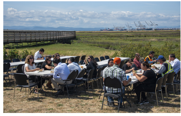
Human Resources held a staff appreciation event on July 24, with managers from each department cooking a BBQ for staff in the picturesque views of the TFN estuary behind the Admin Building.

HR is currently collaborating with the Language and Culture team from the Education and Skills Development Department to apply for Indigenous focused grants for "Cultural Safety and Cultural Humility" training for emergency management personnel.