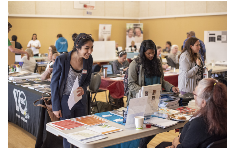
The 2019 Health and Social Services TFN Health Fair was a big hit, with Members and TFN staff attending and receiving wellness and health tips and treatments.

The Policy for the Disposition of Falcon Way Lots and Rental Units is in the process of being updated and reviewed in detail by Executive Council. The proposed changes will benefit Members and help them further simplify their home construction process on Falcon Way. As per EC's direction, Staff are amending the Policy to be brought back for feedback and further changes.