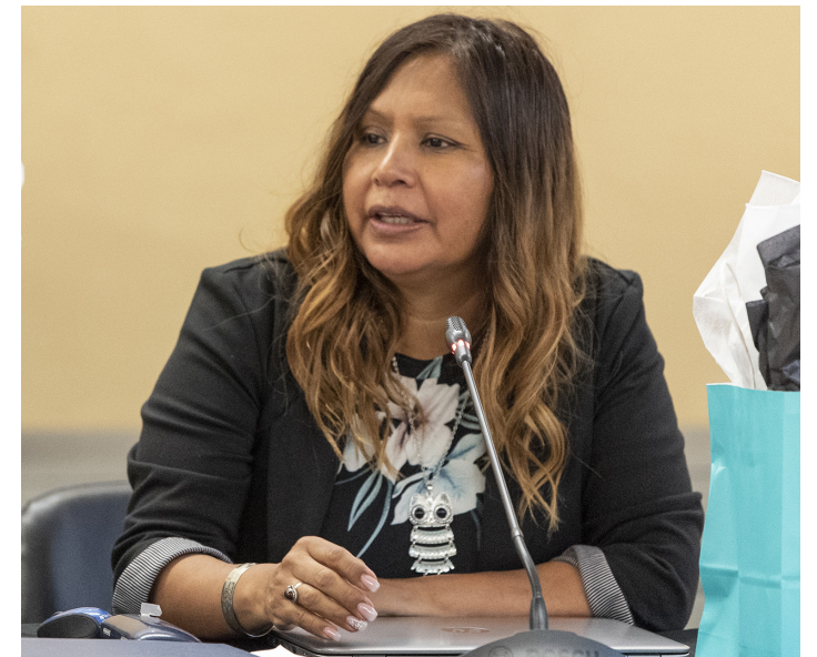
Several partner Nations from the Lower Fraser Fisheries Alliance visited Tsawwassen Lands on June 27 to share their views.