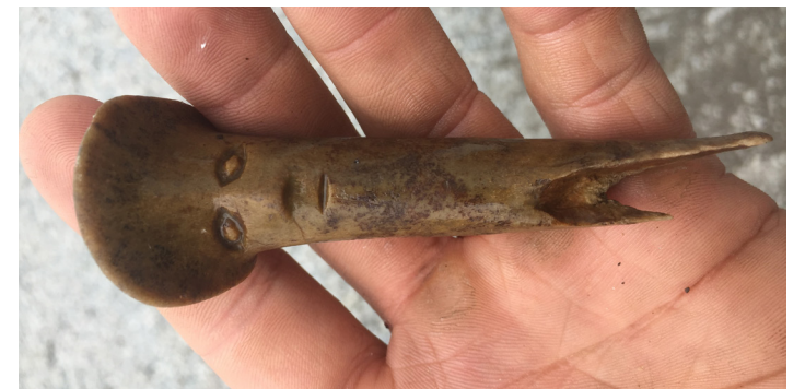
An anthropomorphic carving unearthed at the Boundary Bay wetsite at the end of June. The dig site is estimated to contain 1,000-2,000 year-old artifacts.

Hiring for field technicians is ongoing.