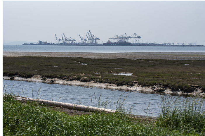
TFN actively participated in the Environmental Assessment for the proposed Roberts Bank Terminal 2 project.