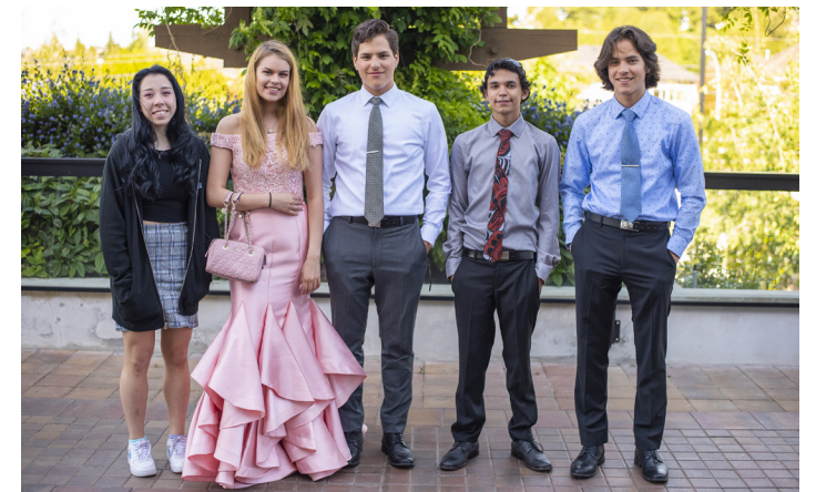
Five of TFN's Eight 2019 graduating Grade 12 students at Tsawwassen Springs on June 11.

The Graduation Ceremony took place on June 11 at Tsawwassen Springs and included a whopping 41 graduate students. This year saw 10 preschool children move on, 12 grade 7 students, eight grade 12 students, four PSE students and seven employment and training students. The hall was packed with 240 Members and their families, as well as friends and even some teachers of the grads.