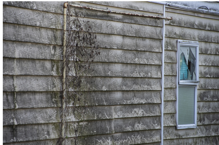
This previously white home on TFN Lands is covered in diesel particulates, which has affected several homes on TFN Lands. Many photos like this were presented to the Review Panel.