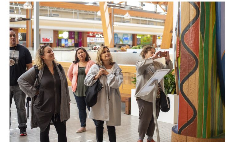
Board Members of the Smithsonian Natural Museum of the American Indian visit Tsawwassen Mills, where TFN carvings are on display.

Under TFN law, these positions need to be filled by a By-Election. The By-Election is scheduled for August 1, 2019.