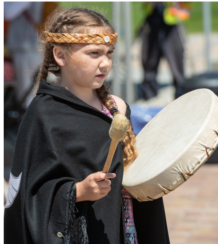
The TFN Drummers marked the occasion of National Indigenous Peoples Day prior to the lunch and community celebrations.