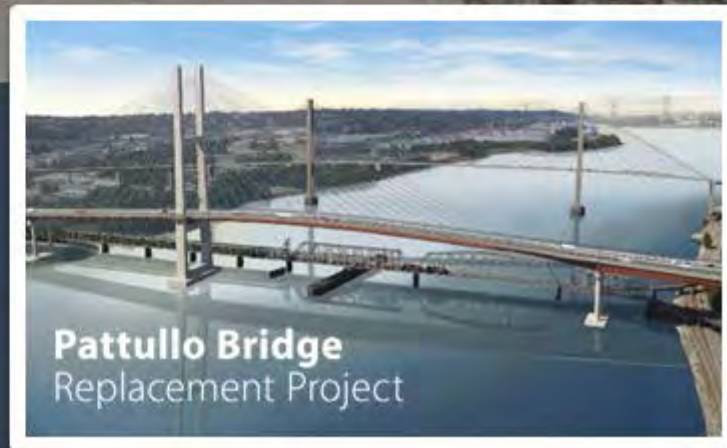
Pattullo Bridge Replacement Project