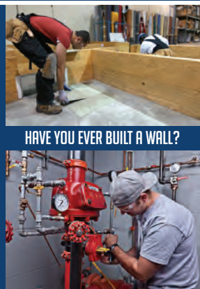
HAVE YOU EVER BUILT A WALL?