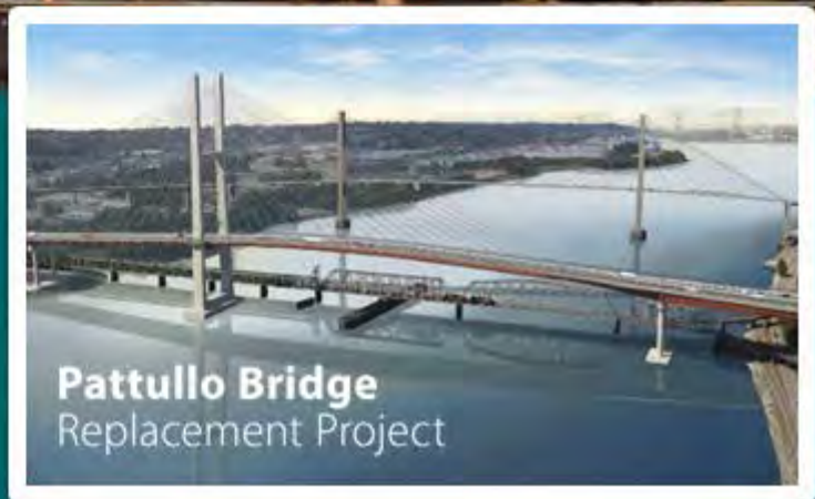
Pattullo Bridge Replacement Project