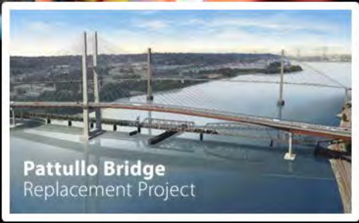
Pattullo Bridge Replacement Project