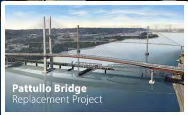
Pattullo Bridge Replacement Project