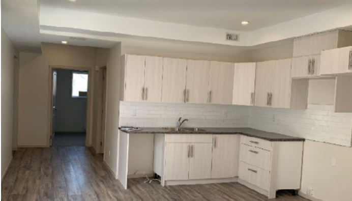
Above: inside 6-plex Unit